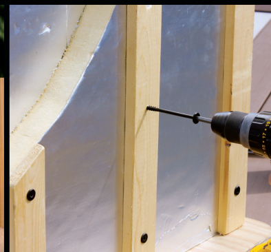
Rigid Foam (SIPs)